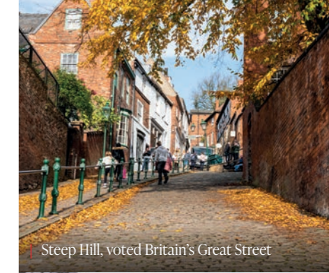
Steep Hill, voted Britain's Great Street

The appropriately named Steep Hill connects 'uphill' Lincoln, around the Cathedral, to 'downhill' Lincoln, where you'll find two shopping centres, modern restaurants, bars, theatres, cinemas, museums and galleries ... plenty for everyone to do and experience. Lincoln is also home to the world famous Christmas Market and Steampunk Festival, while Lincolnshire Showground hosts music events, outdoor cinema and the annual Lincolnshire Show.