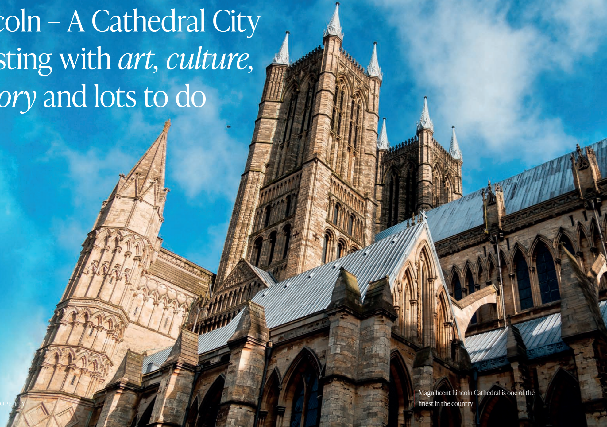
Magnificent Lincoln Cathedral is one of the finest in the country

At Cricketers' Walk, you can enjoy the best of both worlds. Nearby Nettleham has all the picturesque perks of village life, but Lincoln is just a 10-minute drive away.