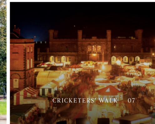
CRICKETERS' WALK 07