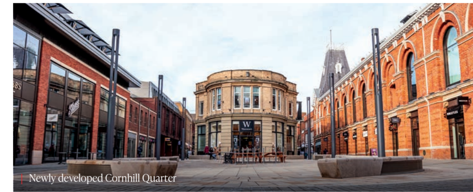
Newly developed Cornhill Quarter